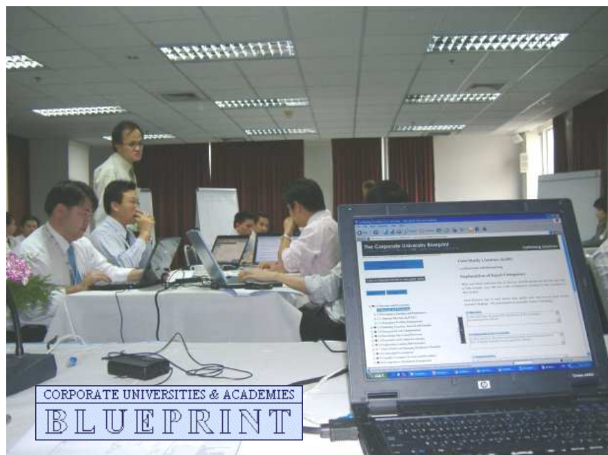
Programme participants using the Corporate University Blueprint management software