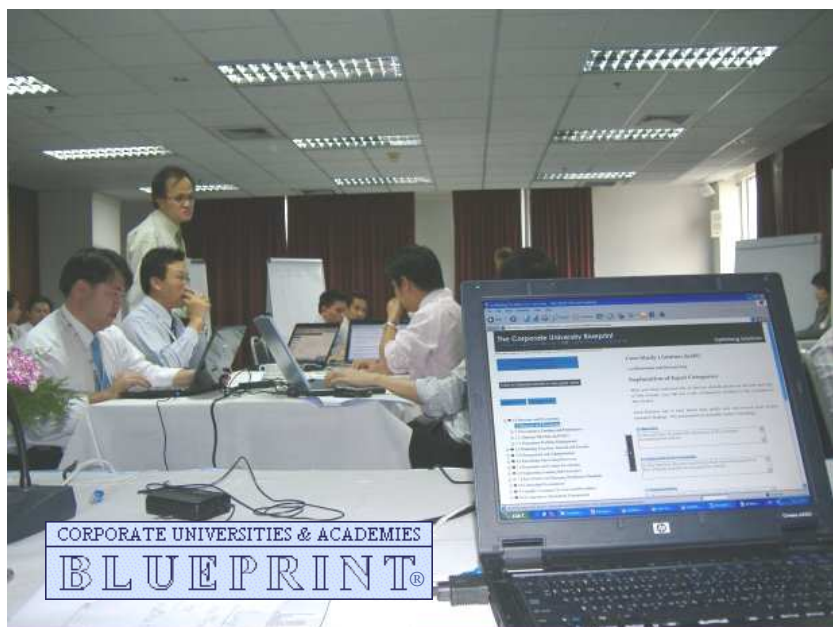
Programme participants using the Corporate University Blueprint® management framework

These programmes are administered by the Vector Programme Board who are known internationally for their leading-edge designs and performance best practices in corporate university and academy management.